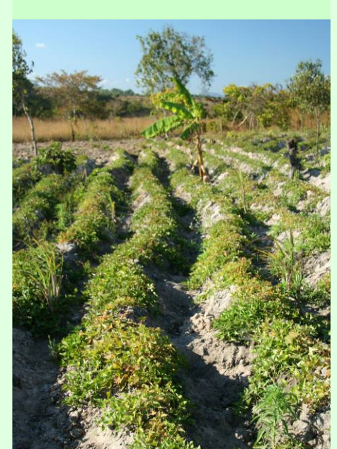
Construction of contour ridges in the uplands can reduce runoff and encourage infiltration

Community coordination is critical to the management of catchment and wetlands to achieve a functional landscape. Village Natural Resource Management Committees (VNRMC) are one way in which this may be achieved. Through such institutions and the plans and bylaws they develop, it is possible to ensure that the land is used wisely, balancing environmental functioning and livelihood needs (see PBN 2).