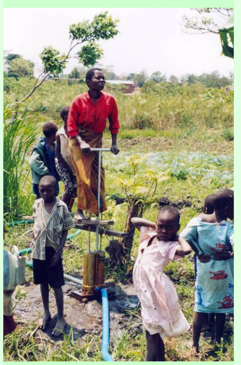
Treadle pumps can have a serious impact on the wetland water table