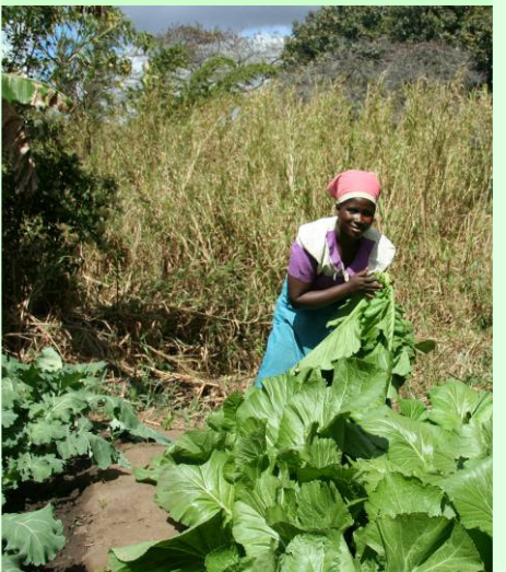
The SAB approach seeks to allow the use of wetlands for livelihood development through encouraging sustainable management practices