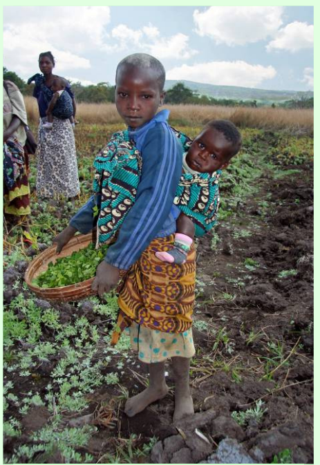
Wetland food production is helping improve the nutritional status of communities, especially children and adults suffering from HIV/AIDS.

uplands, as well as maintaining the environmental services of these areas.