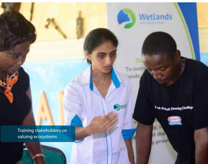
Training stakeholders on valuing ecosystems