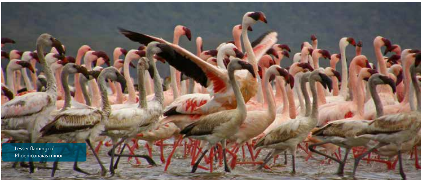
Lesser flamingo / Phoeniconaias minor

To sustain and restore wetlands, their resources and biodiversity.