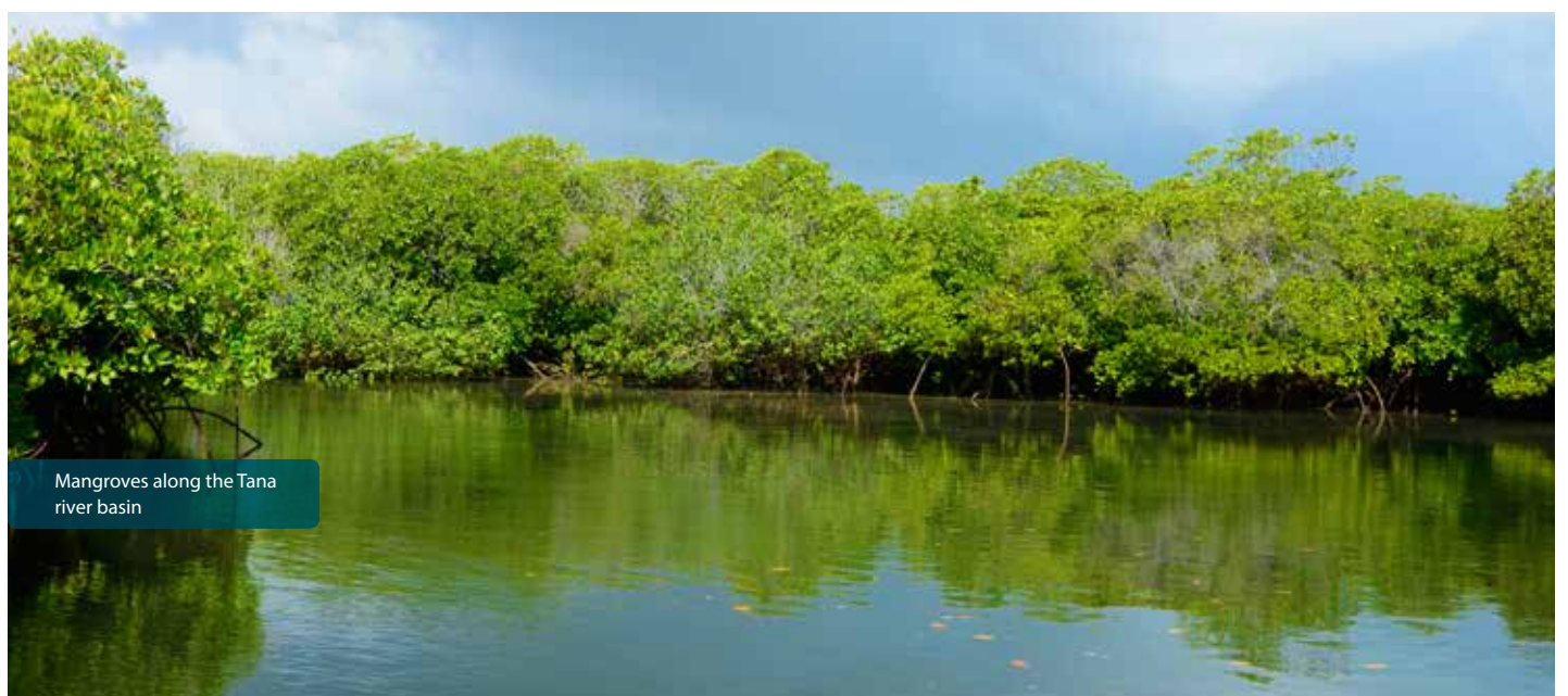
Mangroves along the Tana river basin