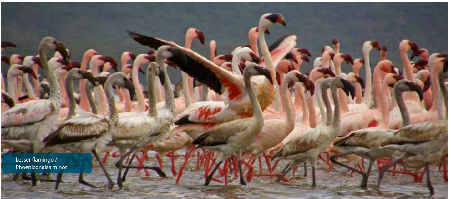
Lesser flamingo / Phoeniconaias minor

To sustain and restore wetlands, their resources and biodiversity.